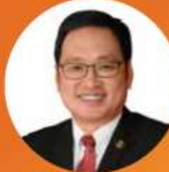
YB Chong Chieng Jen Deputy Minister of Domestic Trade & Consumer Affairs (KPDNHEP)